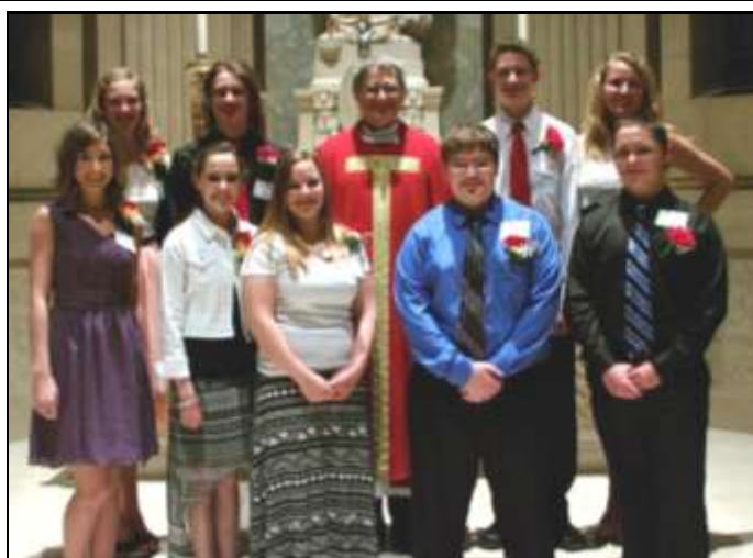
St. John 2014 Confirmation Class