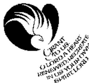
St. Joseph - Miesville