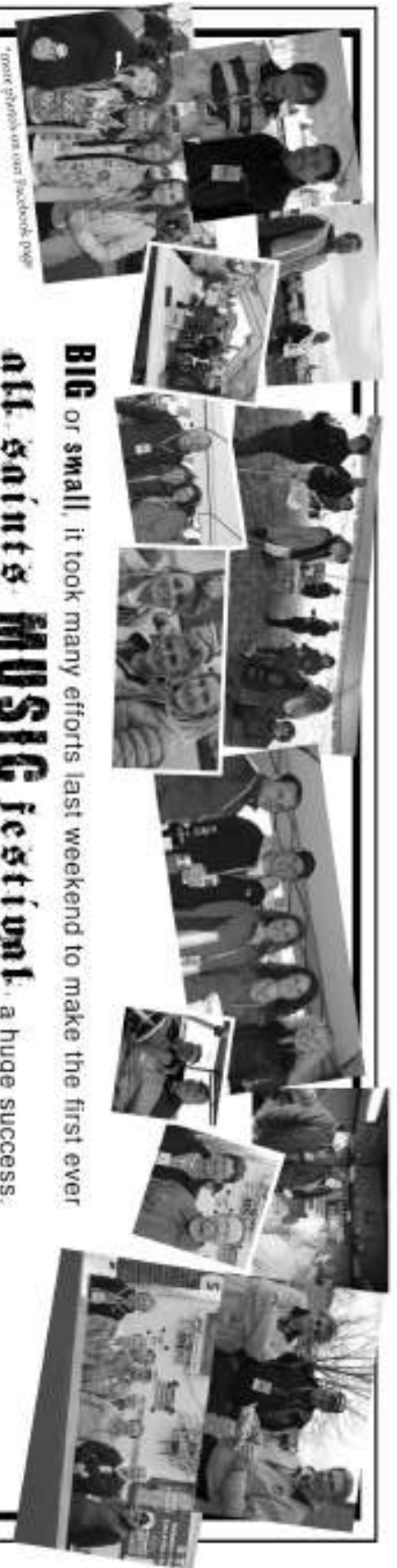
*Great photos on our Facebook Page

BIG or small , it took many efforts last weekend to make the first ever All Saints' MUSIC festival , a huge success.