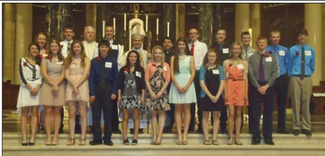
St. Pius V - Cannon Falls